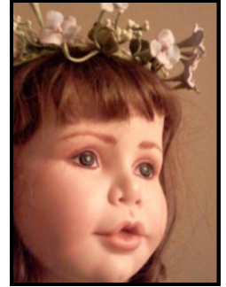
Relief in progress, Oil based clay